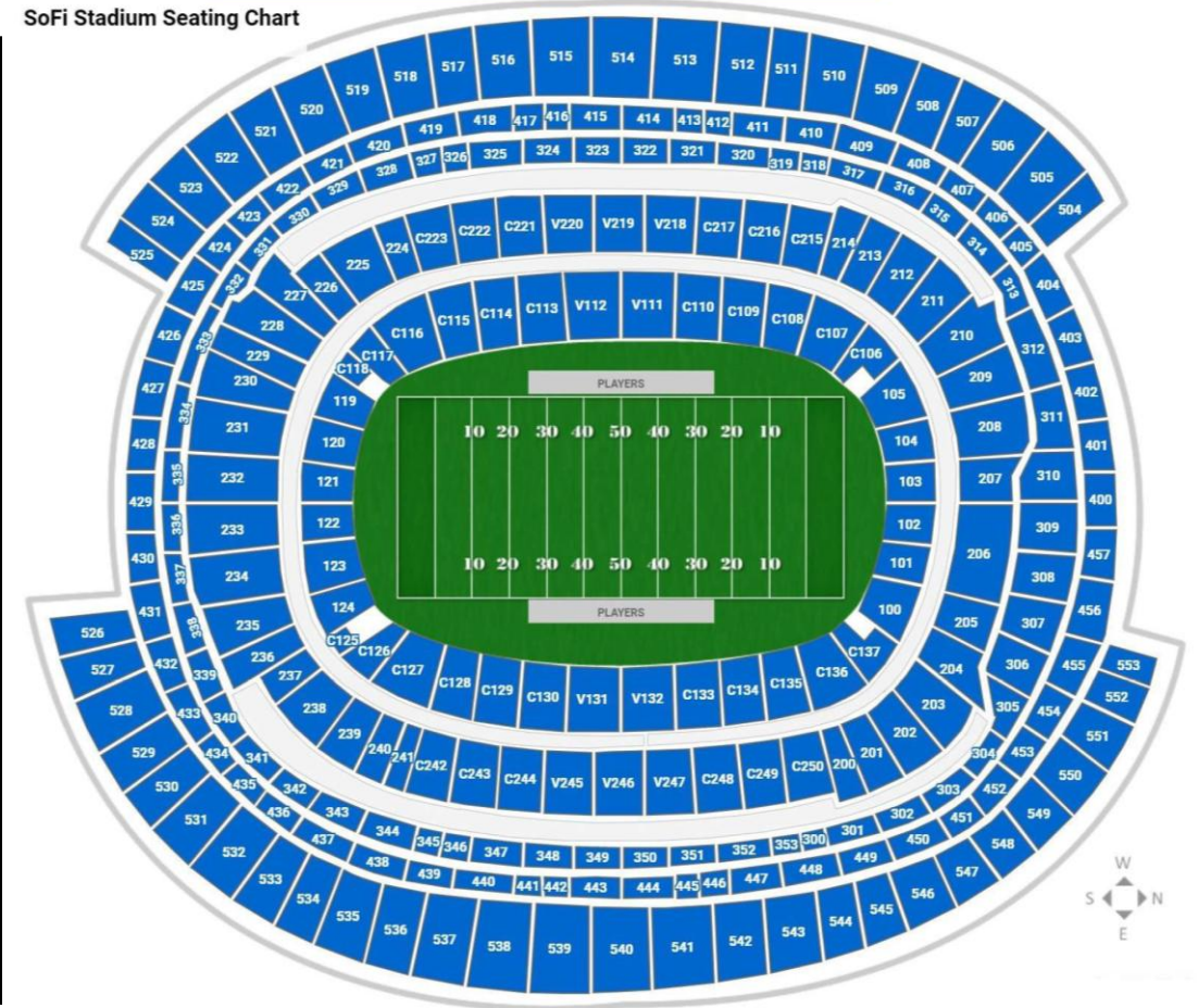
SoFi Stadium Seating Chart