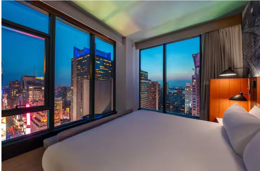
Tempo by Hilton