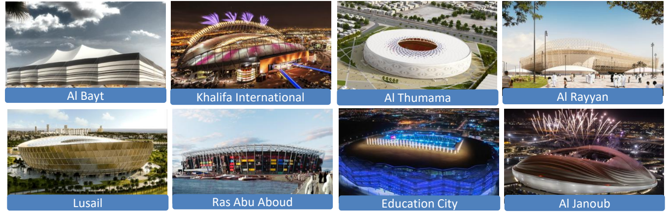
Eight state-of-the-art stadiums with advanced open-air cooling technology ready for the World Cup 2022