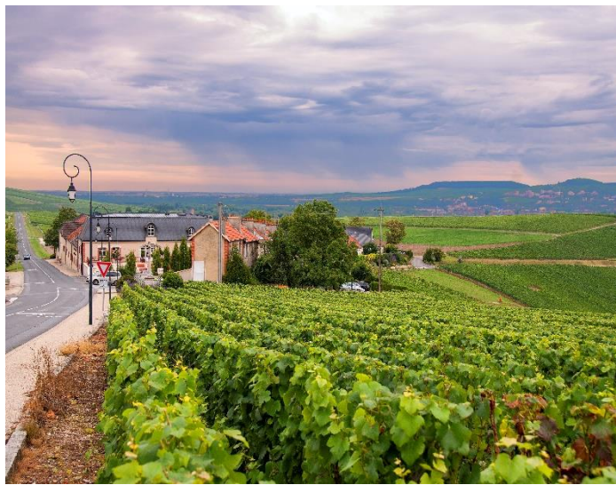
Day 1 – July 23<sup>rd</sup>, 2024 (Arrival)