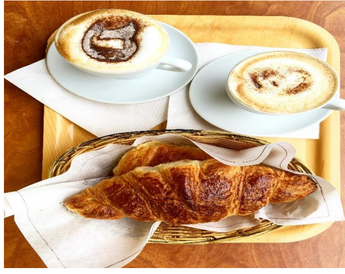
Day 4 – July 26<sup>th</sup>, 2024